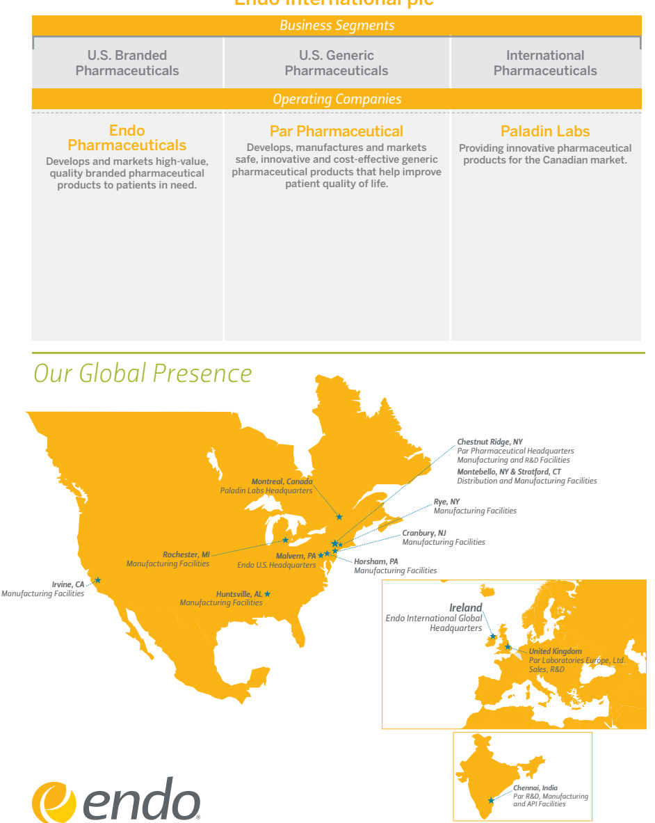
Endo International plc